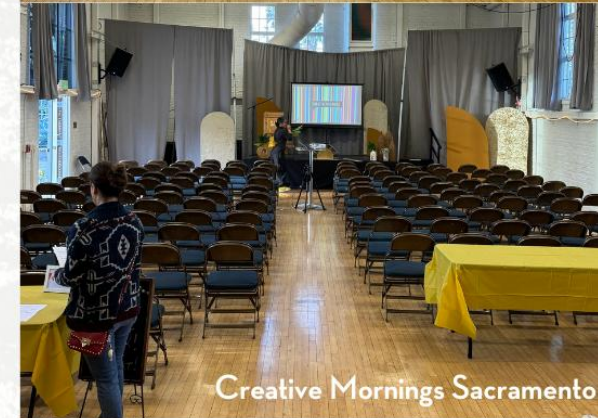
Creative Mornings Sacramento