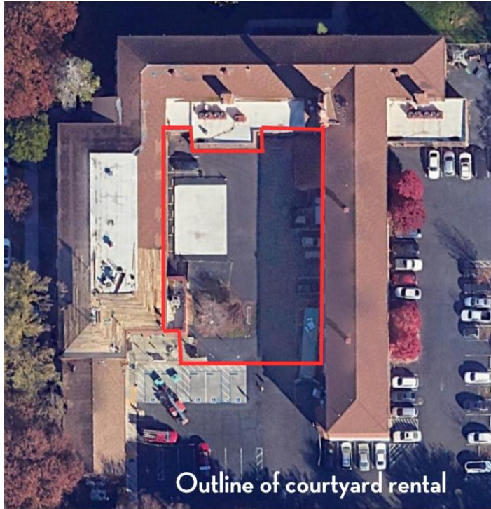
Outline of courtyard rental