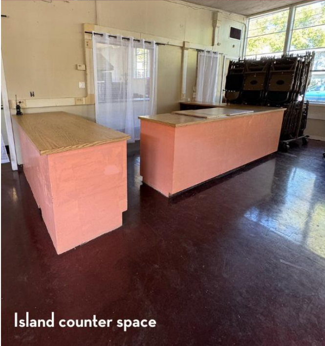
Island counter space