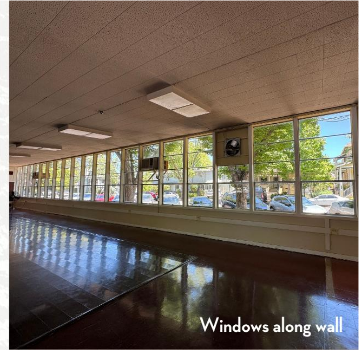
Windows along wall