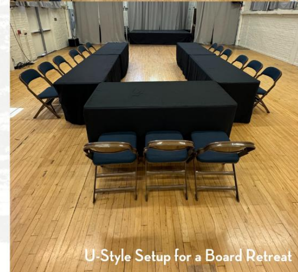
U-Style Setup for a Board Retreat