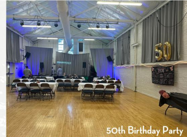
50th Birthday Party