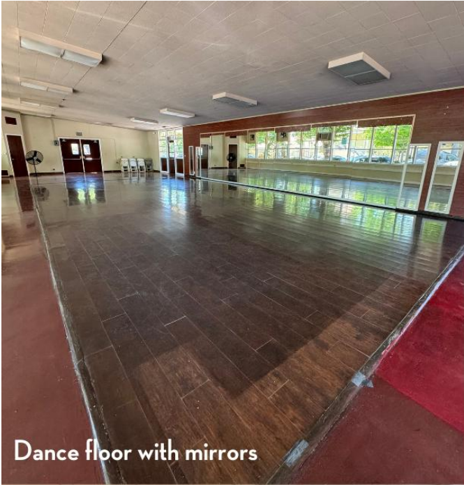
Dance floor with mirrors